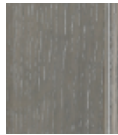
SHELL GRAY/ CERUSED