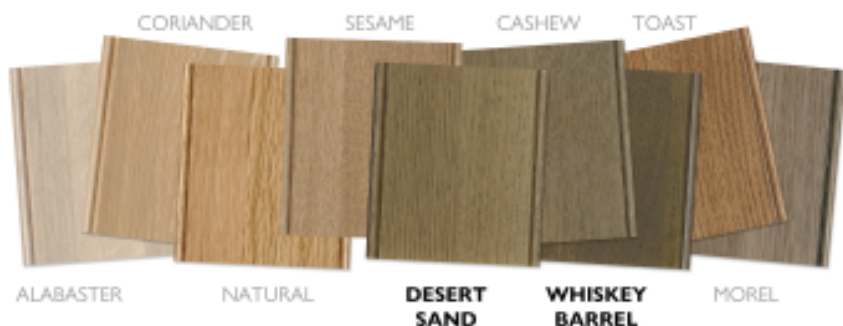
Dura Supreme's True-Brown stains shown on Quarter-Sawn White Oak

Discover your new go-to stain colors: Whiskey Barrel and Desert Sand! These two fashion-forward stains are true-brown hues that are organic and warm yet modern and sophisticated. Whiskey Barrel and Desert Sand expand our palette of soft, neutral, true-brown stains that are continuing to grow in popularity.